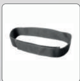
Chest strap/ leg strap