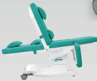
Top position changing