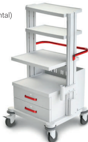
TM-9 (for gynecological room, instrumental)