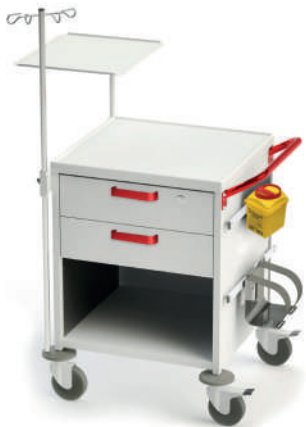
TM-10 (for emergency treatment)