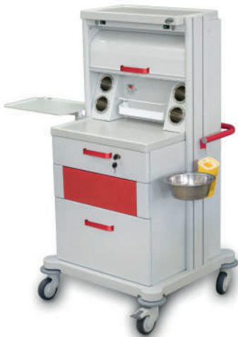
TM-8 (for gynecological room, instrumental)