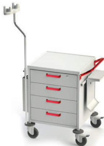
TM-11 (for endoscopy)